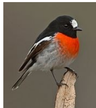
Right Female Scarlet Robin.