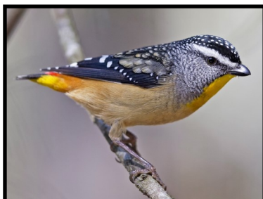
Left. Spotted pardalote