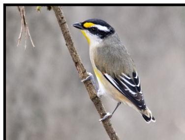
Right Striated pardalote