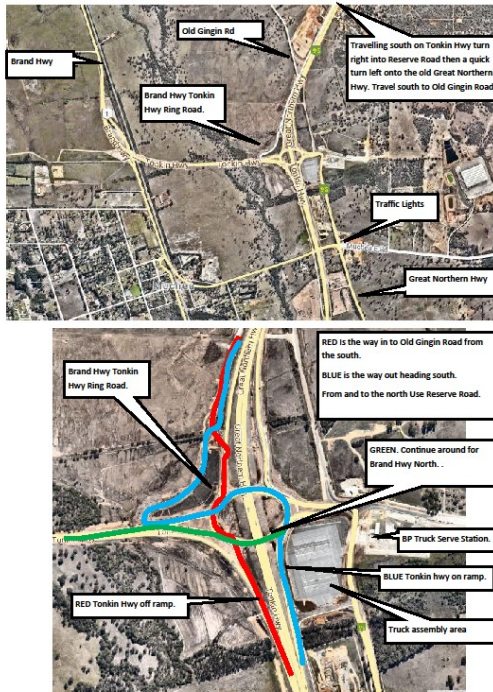
How to get to the Chittering Landcare Centre.

WHEN: 5pm , 9th April WHERE: Chittering Landcare Centre BRING: Hat, Water Bottle, binoculars, insect spray BBQ TEA: Meat supplied, Bring a plate of salad OR a sweet..